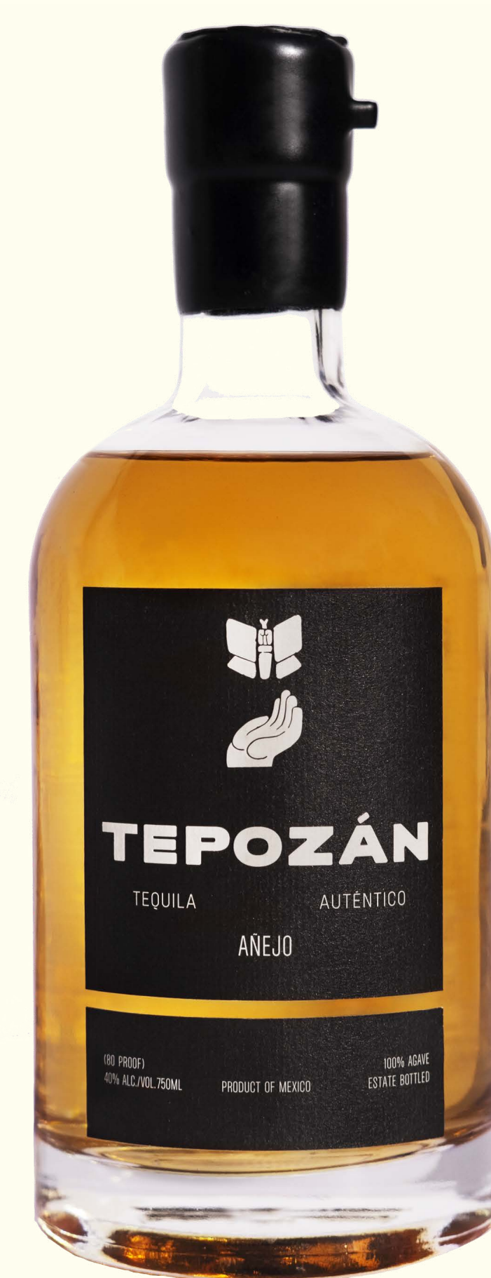
750 ML AÑEJO

Aged 4 months in Kentucky White Oak Bourbon Barrels adding a honeyed aroma and generous taste of brown sugar and pineapple sage.