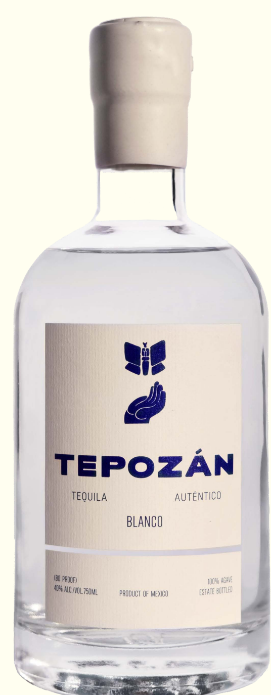
350 ML BLANCO