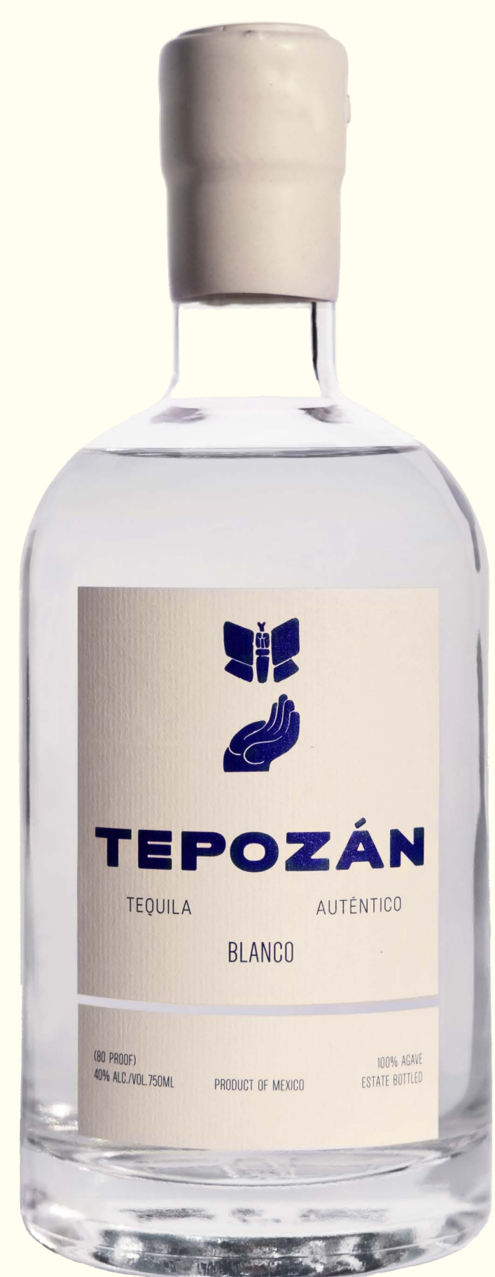
750 ML BLANCO

Straight from the field, verdant and wild, allowing the flavors of the agave to be tasted in its purest form.