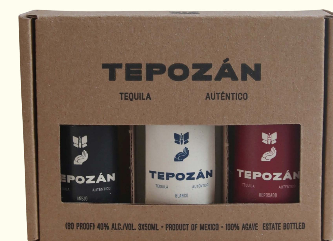
SAMPLE 3 PACK 50 ML