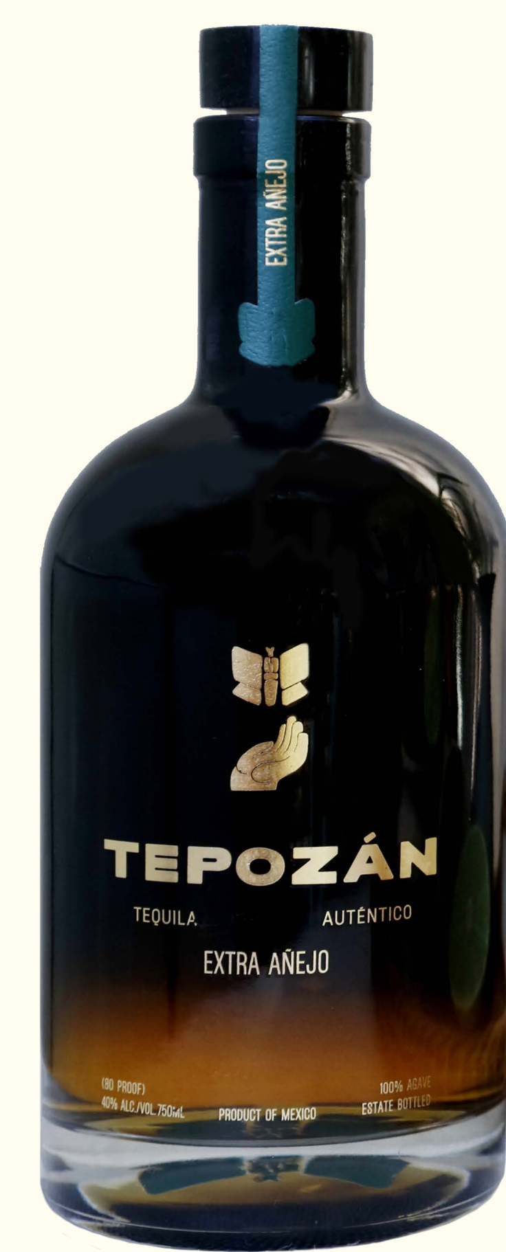
750 ML EXTRA AÑEJO

Aged 4 months in Kentucky White Oak Bourbon Barrels adding a honeyed aroma and generous taste of brown sugar and pineapple sage.